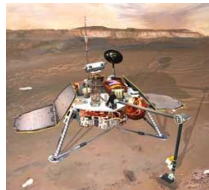
Artist's concept of Mars Polar Lander near the Martian south pole.

Finding the spacecraft on the surface largely intact, however, could cause some reconsideration of those conclusions. It could also bolster claims that signals picked up by a radio telescope in late December 1999 early January 2000 were from the lander. The possibility that the weak signals, detected by 45-meter antenna at Stanford University, rejuvenated the search for the lander in late January and early February of last year. NASA enlisted several radio telescopes to listen for any signals from the lander, but none were detected.