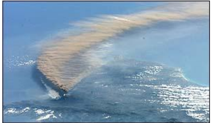
Dust plume is blown towards Africa

The crew were able to observe Etna's recent activity, and photograph the details of the eruption plume, as well as smoke from fires triggered by the lava as it flowed down the 3,350-metre-high (11,000 feet) mountain.