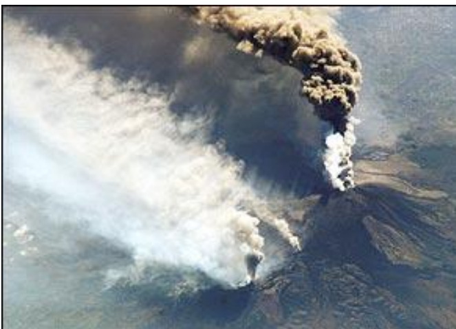
The image captured by the Expedition Five crew on the International Space Station is looking to the southeast. It was taken on 30 October, 2002, at about 1130 GMT.

Astronauts on board the International Space Station have taken two spectacular images of erupting Mt Etna in Sicily.