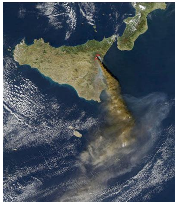
Picture from NASA's Terra satellite October 28

It was triggered by a series of earthquakes on 27 October. The astronaut images were taken three days later on 30 October at about 1130 GMT from an altitude of 400 km (250 miles).