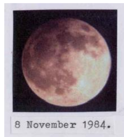
Picture: the penumbral eclipse (Saros 116) one Saros earlier on November 8, 1984

This eclipse is Saros 116, which began as a 0.035 penumbral on March 10, 993 AD, became a 0.058 umbral on June 16, 1155 AD, and became total on September 21, 1317 AD. The last total took place on July 11, 1786, while the last umbral occurred on October 7, 1930 (0.029) and was a total penumbral on October 18, 1948. The last eclipse of Saros 116 will take place with a 0.064 penumbral on May 14, 2291.