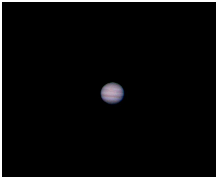
Jupiter Feb 2004 captured with a 10" Newtonian and Sony DSC 50 2MP camera held at the eyepiece. Note the Great Red Spot top centre.

Most of your pictures will not be as clear, sharp or bright as other methods but they will be recorded by you in your own back yard.