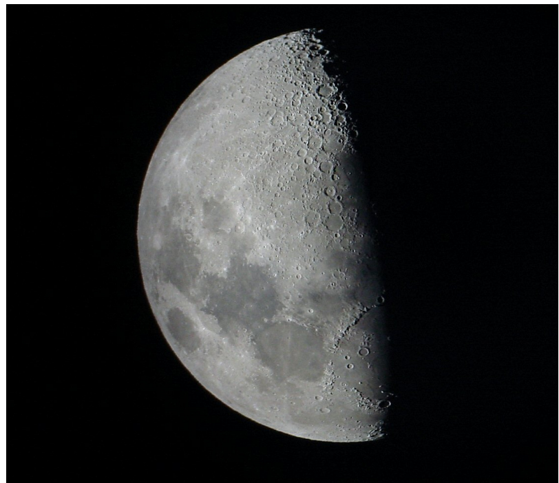
The Moon Jan 2004 captured with a 10" Newtonian and Sony DSC 50 2MP camera held at

The problem is many of us want to record our image with some sort of photo and don't want the expense or difficulty associated with imaging. Is there a cheap and simple way of capturing objects? The simple answer is yes. All we need is a simple digital camera.