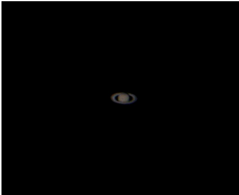
Saturn Feb 2004 captured with a 10" Newtonian and Sony DSC 50 2MP camera held at the eyepiece.

The types of work you could do is quite varied, you can record bright double or variable stars, Phases of planets, Surface details, Positions of satellites or the moons surface and features.