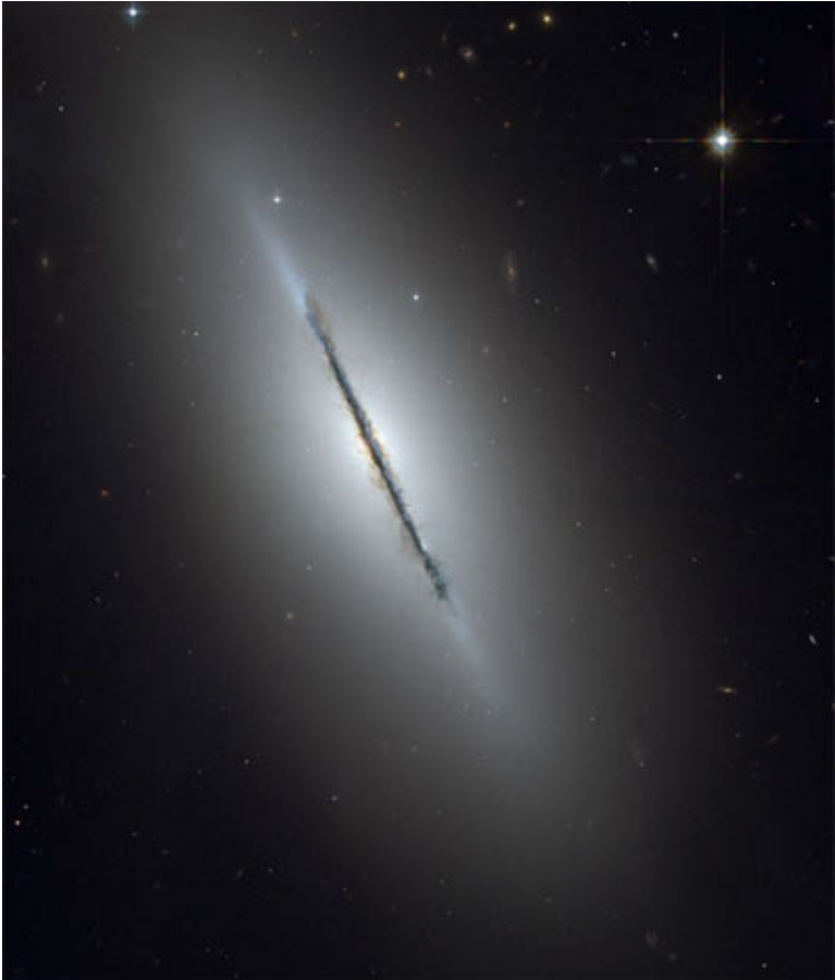
Download larger image version here

with disks like spirals and large bulges like ellipticals, are called 'lenticular' galaxies.